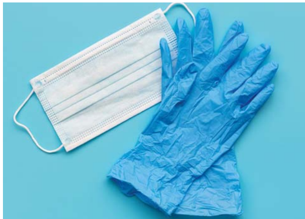
Masks and Gloves

Add face shield or eye protection if you will be touching the patient or will be within 6 feet for more than 10 minutes.