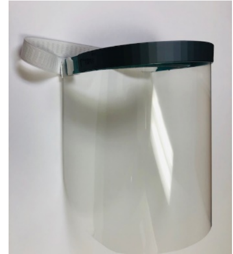
HPH Face Shield