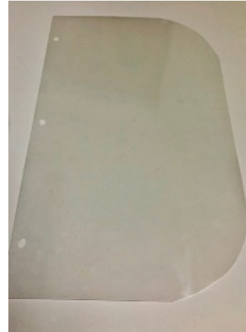
Replaceable plastic laminate