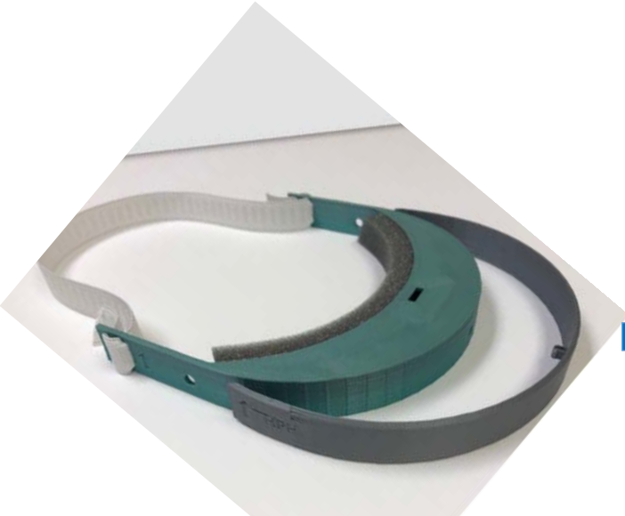
HPH Head frame with removable clip