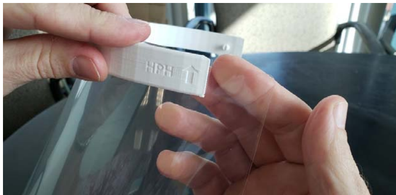
Arrow in "UP" position