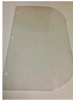
Replaceable Plastic Laminate