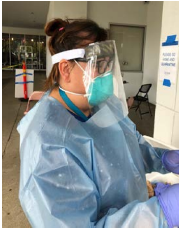
Head gear (Any type)

Wear mask and face shield through multiple patients. Break back tie on fresh gown in order to don over head gear.