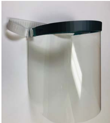
Face Shield (HPH, commercial or other)