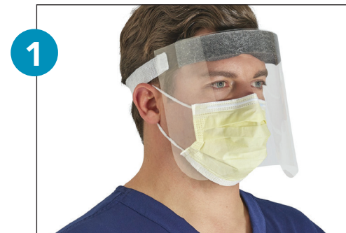
surgical mask, face shield

Headgear remains on health care worker through multiple patients (i.e., do not replace per patient)