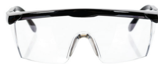
Goggles (Adequate but not preferred)